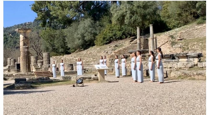
Ancient Olympia Pyrgos