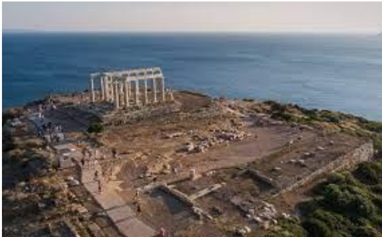
Temple of Poseidon Sounio